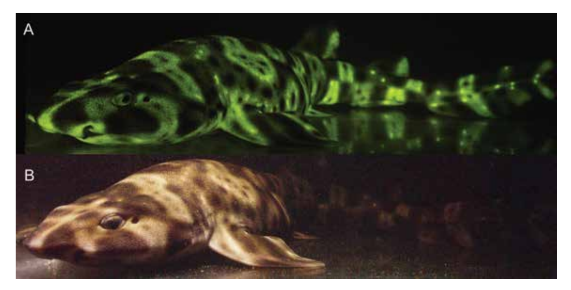
FIGURE 3. Female swell shark ( Celphaloscyllium ventriosum ) imaged under: A. fluorescent lighting (see Materials and Methods); B. white light.

the flippers (fig. 1B) and carapace (fig. 1A, C). We also had the opportunity to image a loggerhead sea turtle ( Caretta caretta ) in captivity at Mystic Aquarium (Mystic, CT), which exhibited primarily green fluorescence on its head and body (fig. 2A–C), flippers (fig. 2B), and plastron (fig. 2C).